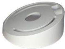
Inclined ceiling mount DS-1259ZJ